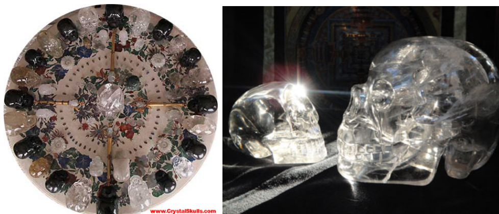
Images of The 22-pound life-size Tibetan Crystal Skull AMAR energizing crystal skulls: (left) AMAR with crystal skulls on 5-foot ceremonial inlaid table; (right) AMAR beaming energy into a crystal skull

When we receive an order, each crystal skull is specifically selected intuitively for you, as the crystal skull chooses its guardian – this is true even for the smallest crystal skulls. Your crystal skull is again placed on the large marble table inlaid with semi-precious stones overlooking a mystical lake. AMAR and CANA IXIM are placed in the center of this table to fully energize and optimally activate your crystal skull for you. We often perform special ceremonies and activations with the cycles of the moon, and on other special, sacred and auspicious dates. We set the highest universal intentions that each and every crystal skull will bring love, light, joy, peace, prosperity, protection, wisdom, guidance, healing, inspiration, fulfillment and wellbeing to all whom they encounter. People can feel these powerful energies emanating from our crystal skulls, sometimes right through the box that they arrive in!