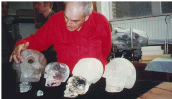
"SHA NA RA", "MAX", and "ET" are some of the few crystal skulls examined to be truly ancient

(PLEASE NOTE: Old and ancient crystal skulls are very rare – beware of fakes . Some people talk about crystal skulls that have no tool marks at all, which are generally modern skulls that come from a mold and are not carved from natural crystal or stones.)