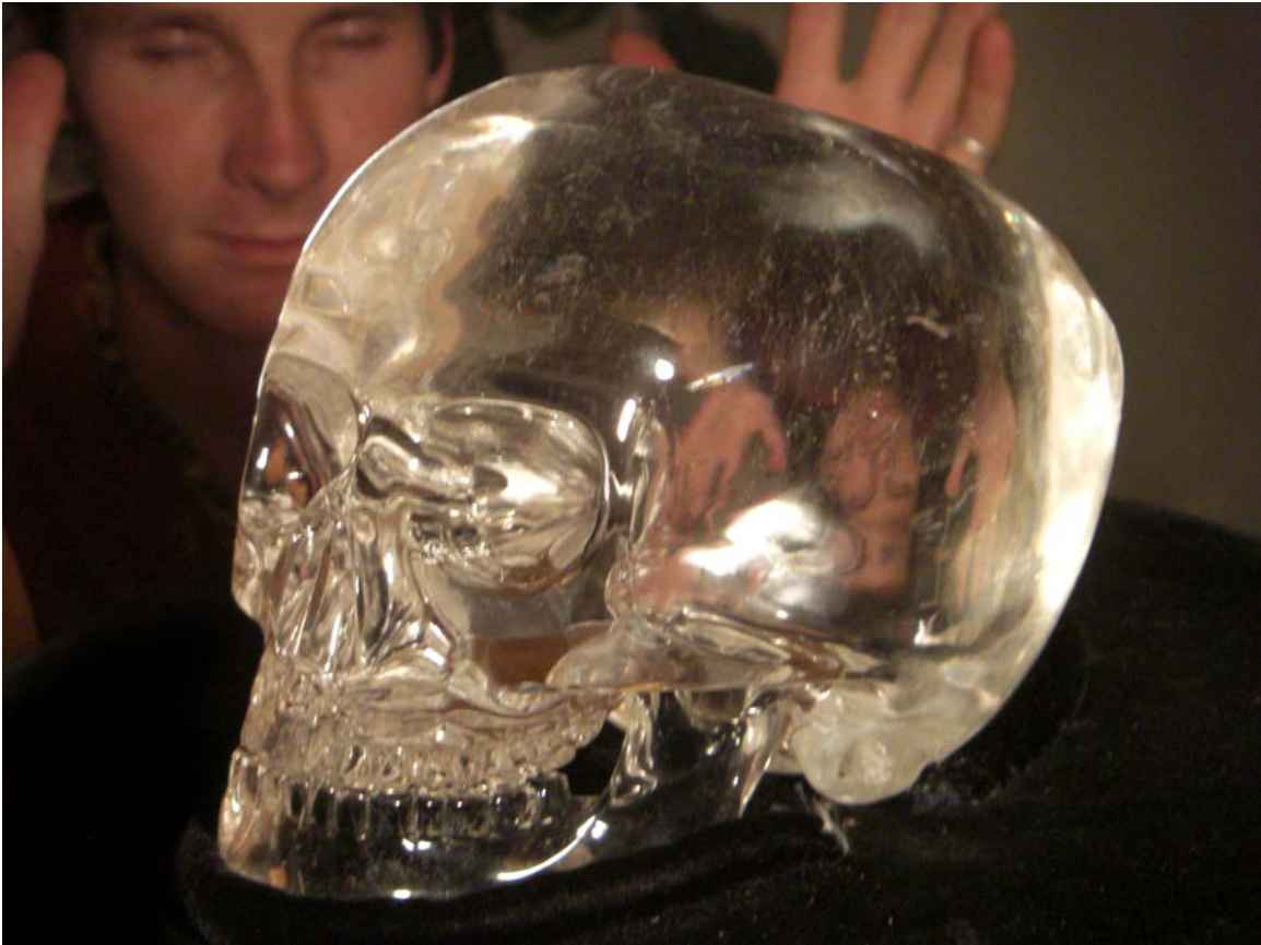
The power of two minds becoming one: Crystal Skulls amplify human consciousness – the bigger & clearer the better!

Some people like to sleep with crystal skulls near them to receive messages in their dreams – other people find it too intense to sleep with crystal skulls in their room. Some people like to carry crystal skulls with them at all times – we recommend that you keep them protected in a pouch, or benefit from wearing crystal skull jewelry. Some people like to create a special altar space or matrix for their crystal skulls. The key is to always listen to your own guidance and trust what feels right to you.