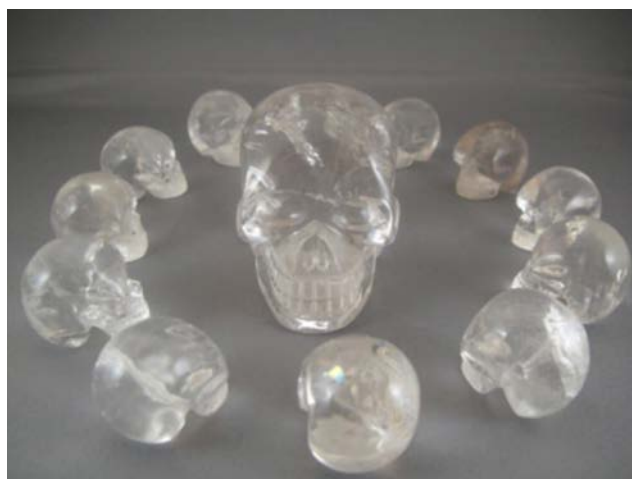
The power of a circular matrix of 12 crystal skulls with a 13 th crystal skull in the center

Some people are perfectly happy with one crystal skull, but crystal skulls are beings with consciousness that tend to want to attract companions to increase their power. When it comes to crystal skulls, two heads can definitely be better than one, and most crystal skull guardians will say: the more the merrier!