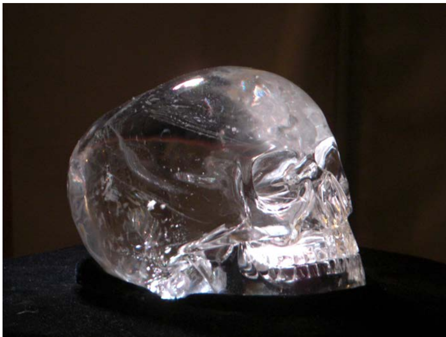
The famous Mitchell-Hedges Crystal Skull

"Most ancient civilizations had great respect for the skull, bordering on worship, because it is the container of the intellect, the personality, the being and the soul of a human being during his or her existence on this physical plane. The skull, or head, is the important portion, and the body is merely a mechanism attached to it to serve its needs. In spite of many movies, television shows, comic books, popular literature and medicine bottles, the skull is a symbol of death only to the uninitiated."