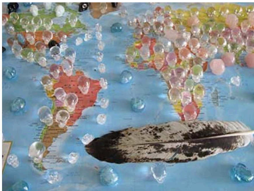
Crystal Skulls holding the light around the World in special activations

Crystal skulls can also serve to relieve pressure in the Earth, much like an acupuncture needle, removing energy blockages and allowing the flow of balance and wellbeing to be restored. Crystal skulls can bring peace to all people, places and things that surround them. This is why people all over the world are guided to work with as many crystal skulls as possible, and to share them with others.