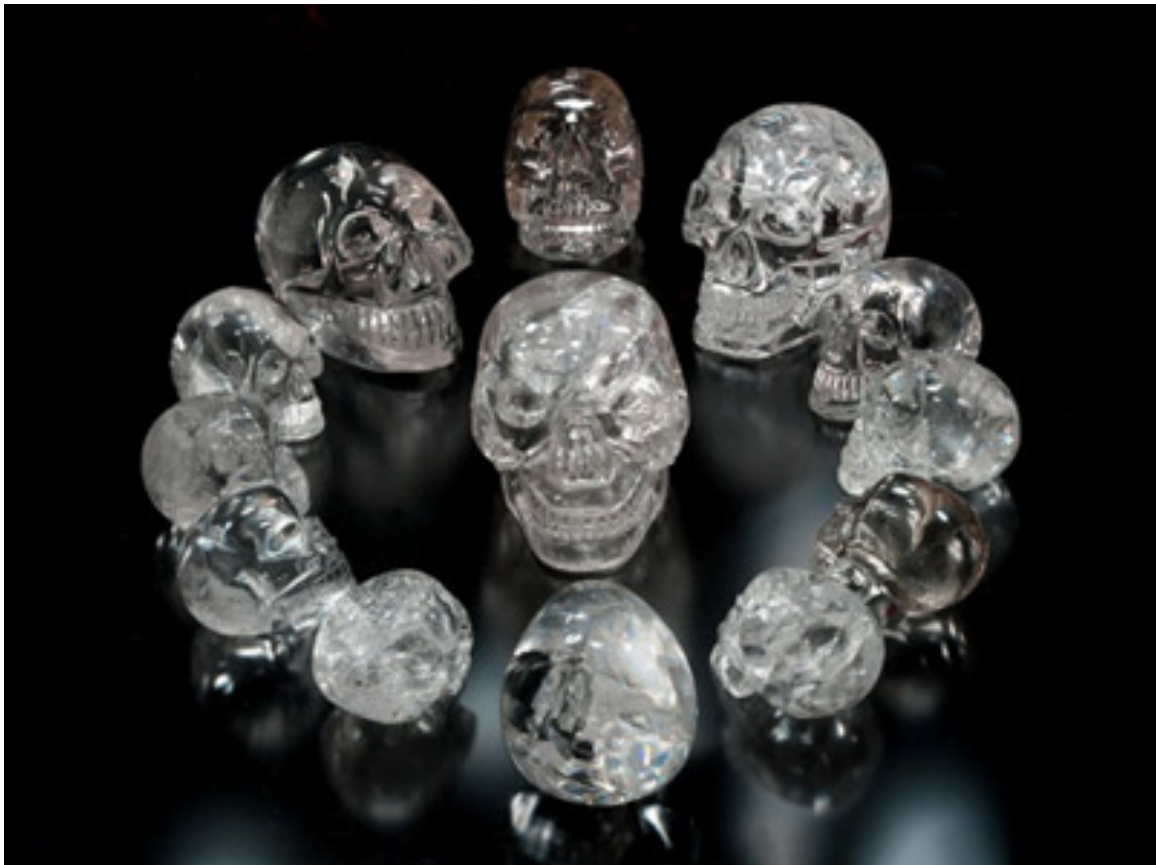
The Tibetan Crystal Skull AMAR with 12 life-size crystal skulls from CrystalSkulls.com

Listen to your free meditation: http://www.crystalskulls.com/crystal-skulls-earth.html