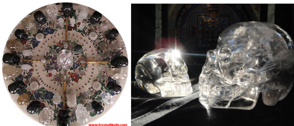
Images of The 22-pound life-size Tibetan Crystal Skull AMAR energizing crystal skulls: (left) AMAR with crystal skulls on 5-foot ceremonial inlaid table; (right) AMAR beaming energy into a crystal skull

When we receive an order, each crystal skull is specifically selected intuitively for you, as the crystal skull chooses its guardian – this is true even for the smallest crystal skulls. Your crystal skull is again placed on the large marble table inlaid with semi-precious stones overlooking a mystical lake. AMAR and CANA IXIM are placed in the center of this table to fully energize and optimally activate your crystal skull for you. We often perform special ceremonies and activations with the cycles of the moon, and on other special, sacred and auspicious dates. We set the highest universal intentions that each and every crystal skull will bring love, light, joy, peace, prosperity, protection, wisdom, guidance, healing, inspiration, fulfillment and wellbeing to all whom they encounter. People can feel these powerful energies emanating from our crystal skulls, sometimes right through the box that they arrive in!