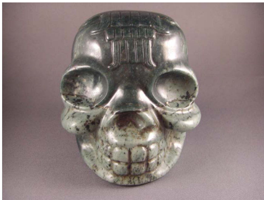
Mayan Blue Jade Crystal Skull CANA IXIM